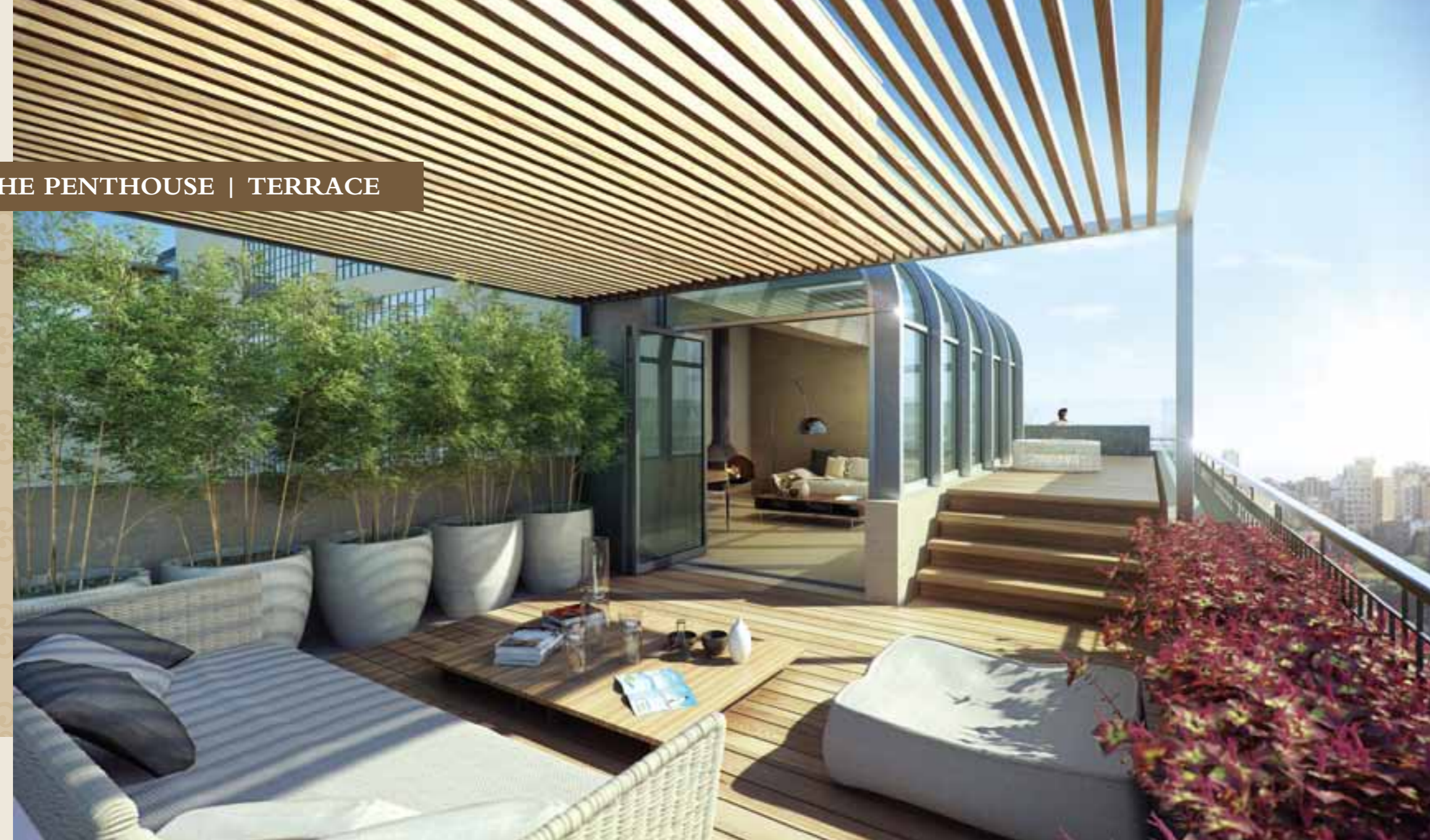
THE PENTHOUSE | TERRACE